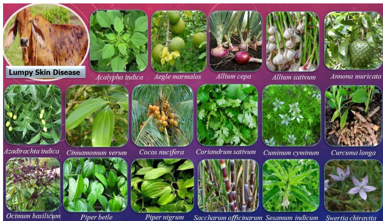
Fig. 2. Several important medicinal plants for the management of Lumpy Skin Disease